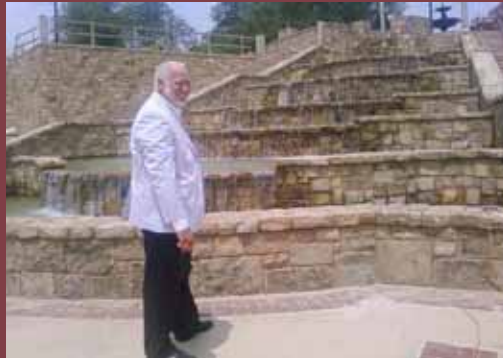
July 3 celebration will be the first official event in the new Lillian Webb Park. Above: Mayor Bucky Johnson watches as water flows from the stairway fountain for the first time.