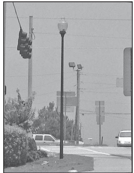
This street light found along Buford Highway is in keeping with the lighting standards established by the city.