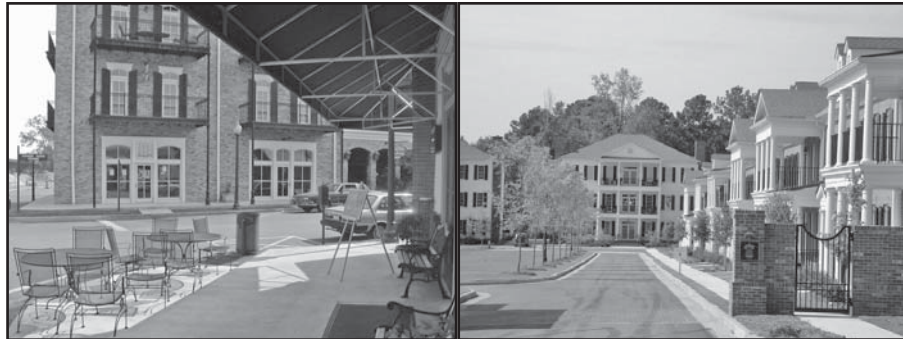
Above left: This site utilizes pedestrian-friendly features such as on street parking, an outdoor cafe area and awnings covering benches. Above right: The introduction of green spaces into planned developments is visually pleasing and improves the quality of life for its users.