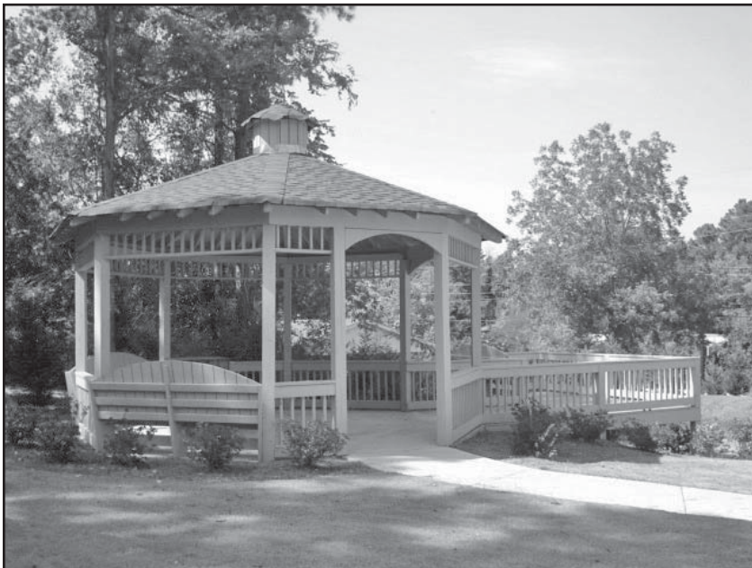
A common area at a multi-family development features a gazebo. Such elements enliven developments and help attract potential residents.