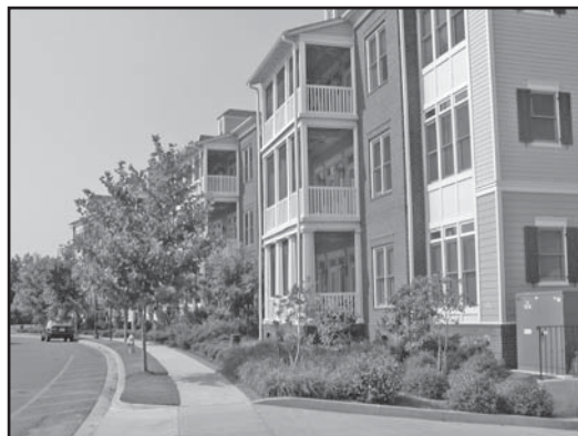
This multi-family complex is friendly to both pedestrians and motorists.

BH 007: All buildings and open space in each development must be connected to a pedestrian walkway system.