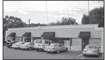
This building presents an unsuccessful attempt at facade articulation.