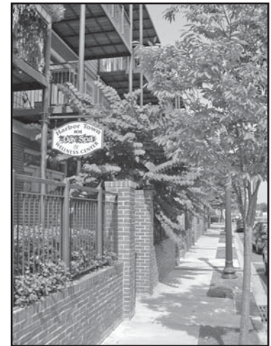
Mixed use of a development for both residential and business enterprises is encouraged. This type of high density development smartly utilizes sites to their full advantage.

BH 005: Pedestrian circulation must be an integral part of the site layout.