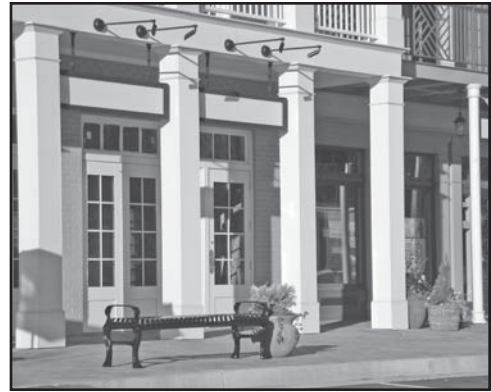
This property features a modern interpretation of a traditional storefront that makes this multi-story building approachable and enjoyable by pedestrians.