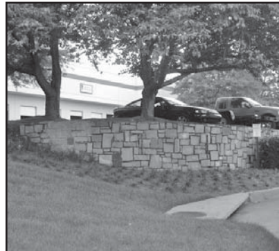
Attractive and high quality site features add significantly to the aesthetics of a site. This retaining wall with its ashlar masonry and plantings create a pleasing atmosphere for this parking lot.