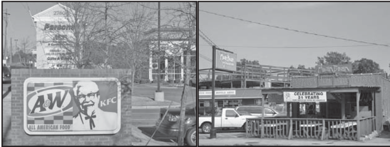
(left) Typical franchise signage can be smaller in scale and sheathed to create a monumental sign in keeping with the goals of the Buford Highway character area. (right) Examples of inappropriate signage include pole-mounted signs, roof-mounted signs and temporary signs that have become, in effect, permanent.

BH 062: External illumination of signage is required.