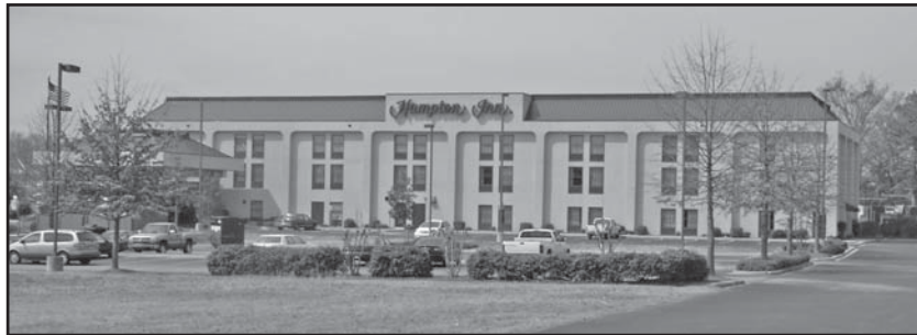
The use of artificial stucco for buildings on Buford Highway is prohibited and will generally be approved only in exceptional situations to be determined by the ARB.