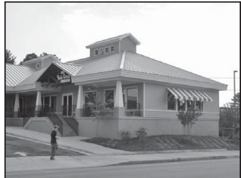
This retail building utilizes a side parking lot and is still inviting to both pedestrians and motorists.

Planting islands are a useful tool in breaking up large expanses of parking. However, islands themselves are not enough. Trees must be planted in the islands with sufficient space for root growth. Trees must be of a mature size to provide shade to vehicles and pedestrians.