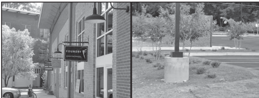
(left) The lighting and signage along this rehabilitated factory building are pedestrian in scale and create a friendly environment. (right) Concrete bases for light poles must be properly sunk into the ground, screened by vegetation, or covered with a more attractive veneer.