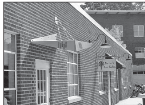
These awnings are appropriately scaled to the pedestrian and are unique to the store helping provide definition of individual businesses. Creativity in awnings is encouraged.