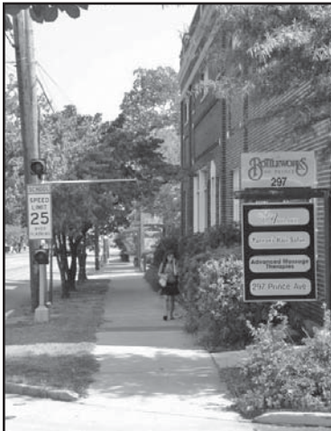
This streetscape is pedestrian-friendly and also provides a visually pleasing corridor for motorists.