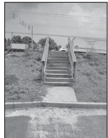
Steep grade changes between public right-of-way and private development require appropriate facilities for pedestrians.