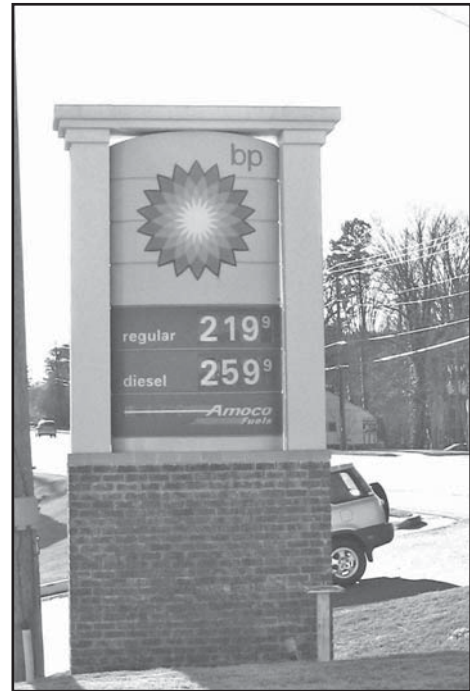
This monumental sign located on Buford Highway outside of the city of Norcross is an attractive alternative to plastic signage.