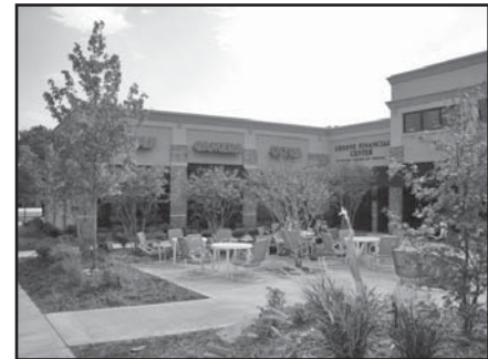
This communal space at a commercial development is a popular place for shoppers.

BH 064: Assigned outdoor play space in multi-family residential communities is required. Pedestrian walkways must be provided for safe access.