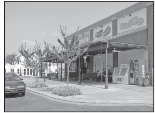
This site utilizes planting islands and street trees which help enliven the pedestrian zone in front of the business enterprise.

BH 004: Vehicular and pedestrian linkages created between properties must be incorporated into developments to the extent possible by topography or other physical conditions.