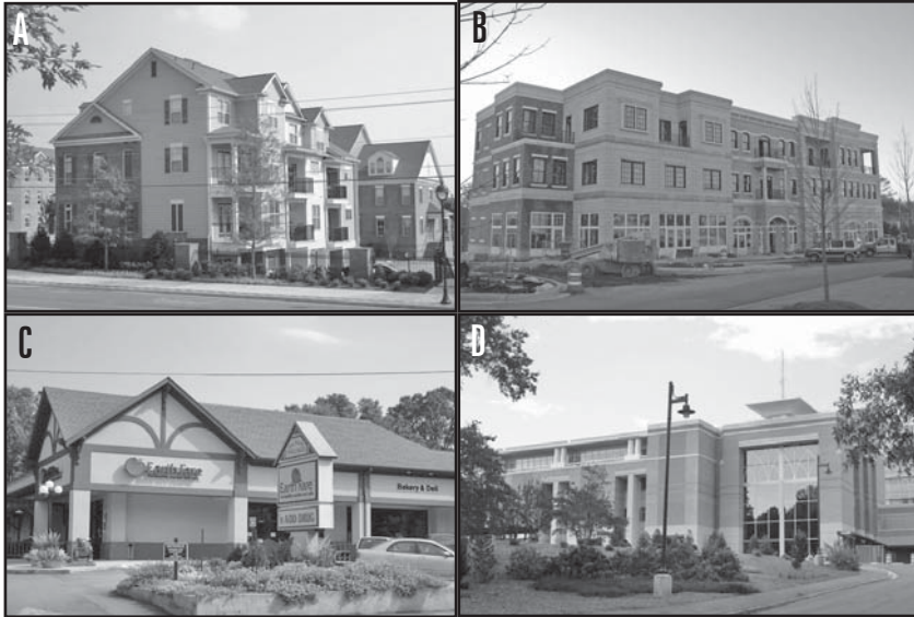
(A) This is a good example of a multi-family development with appropriate facade articulation utilizing brick, clapboard siding, residential-scale windows, bay extensions and porches. (B) This multi-story retail/office building has clearly divided storefronts and good facade articulation. (C) This franchise building uses various facade treatments that enlivens its appearance. Attractive landscaping at the entrance is also a positive feature of the site. (D) Even large buildings can break up expansive facades with good design, as this building demonstrates. scale non-residential building it is important to use articulation that is appropriately scaled, as in this example.