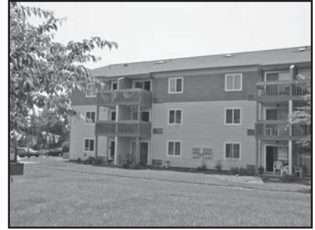
This multi-family building is an example of a facade without significant facade articulation. It also features vinyl siding which is prohibited in the district.