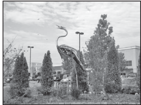
The use of public art within commercial developments add a humanizing effect and enlivens the landscape.