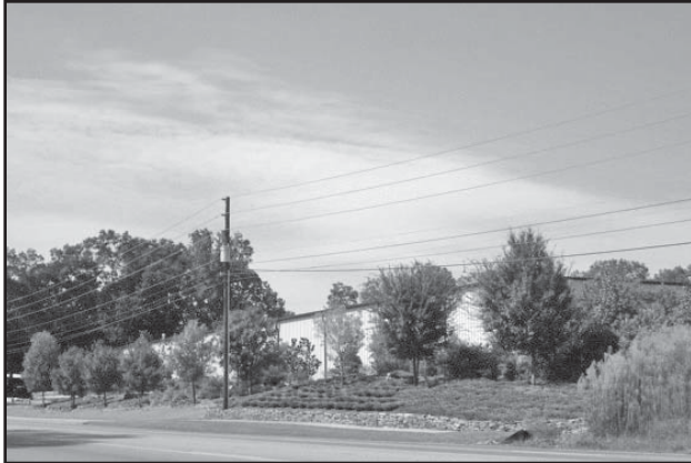
This metal building facade is inappropriate for Buford Highway, however the plantings are a good example of landscape screening that is naturally-looking.