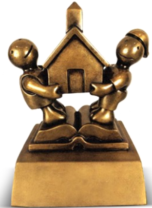
The Broad Prize for Urban Education, awarded to Gwinnett County Schools on October 19, 2010

In an announcement that was televised live nationally from New York, Gwinnett County Public Schools were recently announced the winner of the country's largest education award, "The Broad Prize for Urban Education". Districts do not apply for this award, and according to information sent out by the Gwinnett County Public Schools' Superintendent's Office, to be considered "a district must demonstrate strong student academic performance and improvement, a reduction in income and ethnic achievement gaps, and systemic district policies and practices leading to gains".