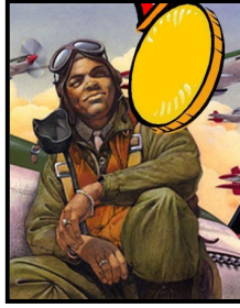
The Tuskegee Airmen earned the Congressional Gold Medal