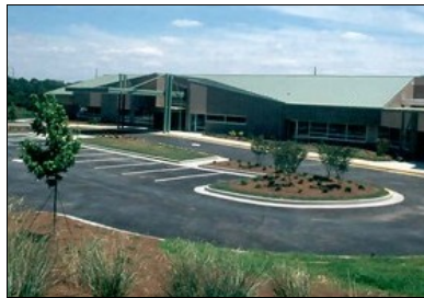
A. Worley Brown Boys & Girls Club at 5360 Old Norcross Road

completed, allowing the club to accommodate 300 more students. This club offers after-school tutoring and homework help, as well as programs like soccer, track and field, and martial arts. The goal is to support and empower boys and girls, and the work they do has a strong positive impact on these kids.