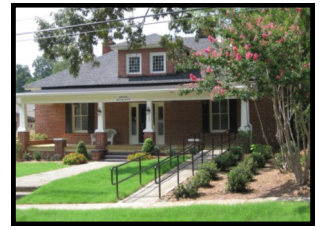
Norcross Welcome Center, located at 189 Lawrenceville Street

“The Tuskegee Airmen: The Segregated Skies of World War II” is a traveling exhibit that explores the history and heroism of the first African-American pilots to fly in combat during World War II. The exhibit tells the exciting story of what drove these men to prove themselves in war, and how they impacted generations of Americans.