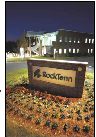
Rock -Tenn Corporate Headquarters, located at 504 Thrasher Street

Rock-Tenn is a leading North American producer of paperboard, containerboard and consumer and corrugated packaging. They operate more than 90 locations throughout the U.S., Canada, Mexico, Chile, and Argentina. It's a huge operation, with its headquarters tucked along the railroad just a few blocks from downtown Norcross. While many people don't realize we have a Fortune 500 company right here in town, Rock-Tenn's generosity and community spirit are evident – and the tremendous value they deliver on many levels, goes without question.