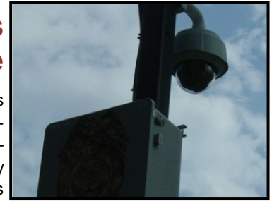
Iron Sky cameras record activity in high traffic areas for added police support.

Video is recorded at 20-30 frames per second, 24 hours a day, and provides real-time surveillance capabilities as well as a recorded history. Activity can be viewed by officers in the field using wireless laptops. The cameras will be integrated to create “zones” that can each be surveyed at a potentially 360 degree radius. Using joysticks, the cameras can be manipulated by remote computer to zoom in, tilt and rotate to best view the area. (continued on page 4)