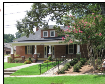
The Norcross Welcome Center & History Museum, 189 Lawrenceville Street (where it's always spring from the looks of it!)