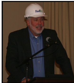
Mayor Bucky Johnson sported a FedEx hard hat while talking about the economic impact of the company's new facility under construction in Norcross.