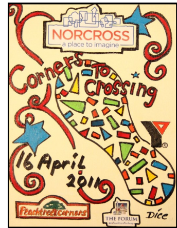
This year's t-shirt design is great motivation to participate!

However the fun doesn't stop at the finish line. The Forum is hosting family events and retail promotions throughout the day; Taste of the Forum is from 2:30p.m.- 4:30p.m. The City of Norcross cranks it up beginning at 1:30p.m. with Spring Break in Norcross, which means that anyone with enough energy left at the end of this exciting day can dance into the evening! For more race info, please go to www.cornerstocrossing.com .