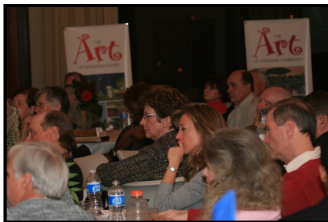
Norcross' creative spirit was the theme in this year's State of the City.