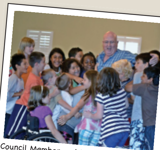
Council Member and Mayor Pro Tem Ross Kaul enjoys a group hug from campers at this summer's Camp Imagine.

To see what's on the calendar, visit http://fpy.ymcaatlanta.org or www.aplacetoimagine.com .